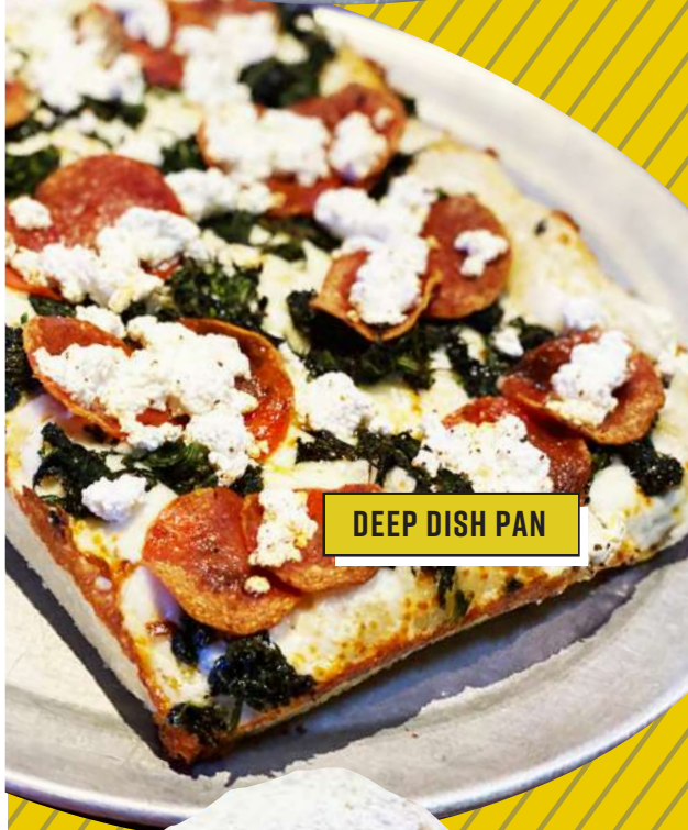
DEEP DISH PAN